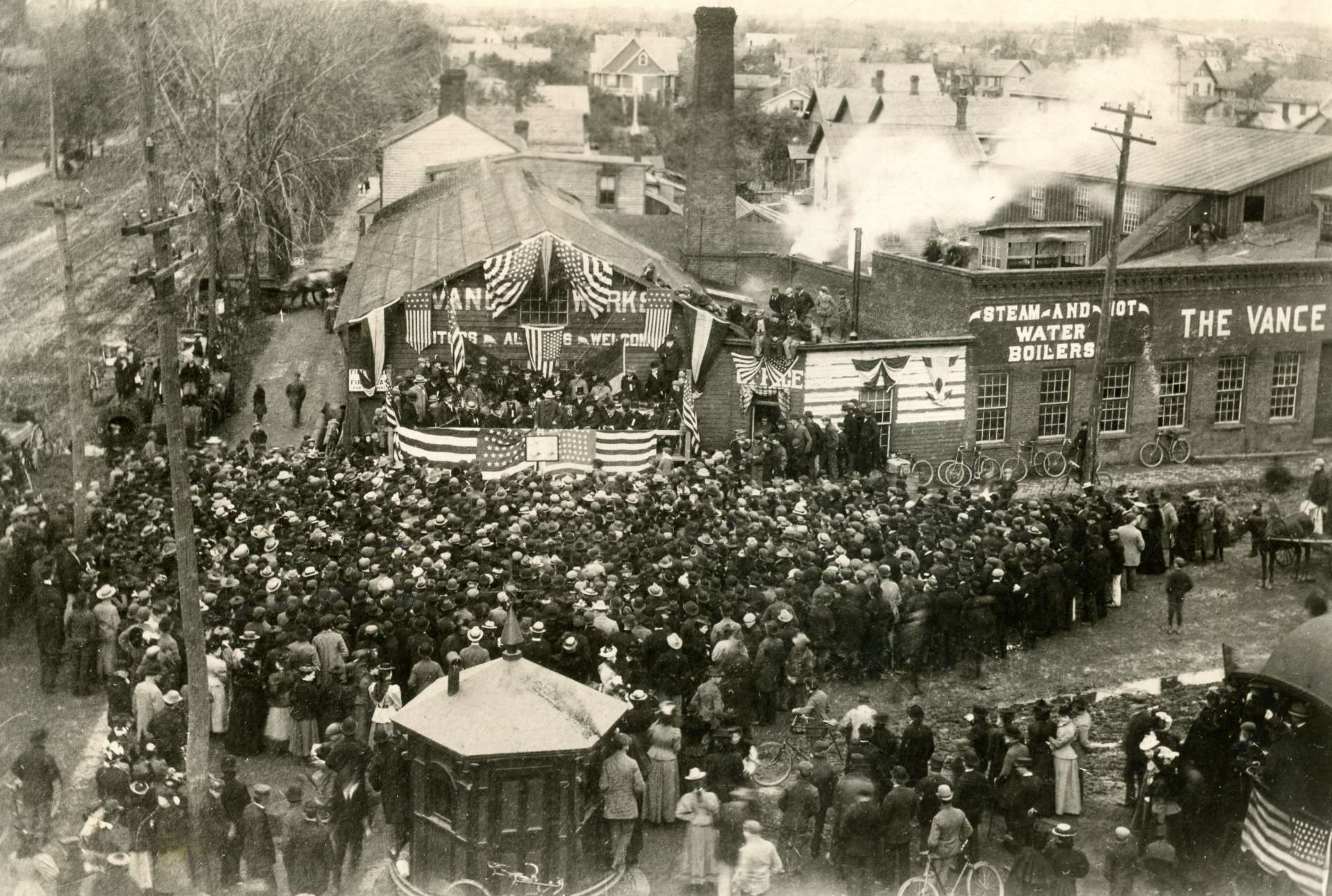
Teddy Roosevelt, center of platform in white hat, campaigning for Governor of New York in 1898. Vance Boiler Works was at the corner of Railroad Place and Exchange Street. St. Francis Roman Catholic Church is in the background.