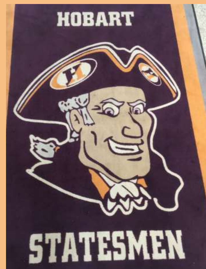
Hobart teams did not have a nickname until September 1936. Reporting on the football game against Amherst College, the New York Times referred to Hobart twice as the "statesmen," and the name stuck.

Hobart is best known for lacrosse, winning 16 national championships. Rowing and sailing has attracted athletes from around the country. In the last several decades, football and hockey have had strong seasons and advanced to post-season championships.