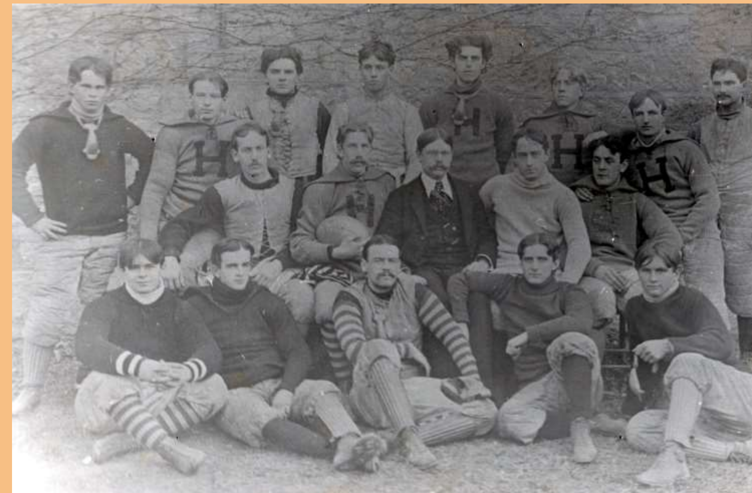
Before helmets were standard equipment, some players used nose guards that covered the nose and teeth. This 1890s photo shows several players with the guards hanging around their necks.