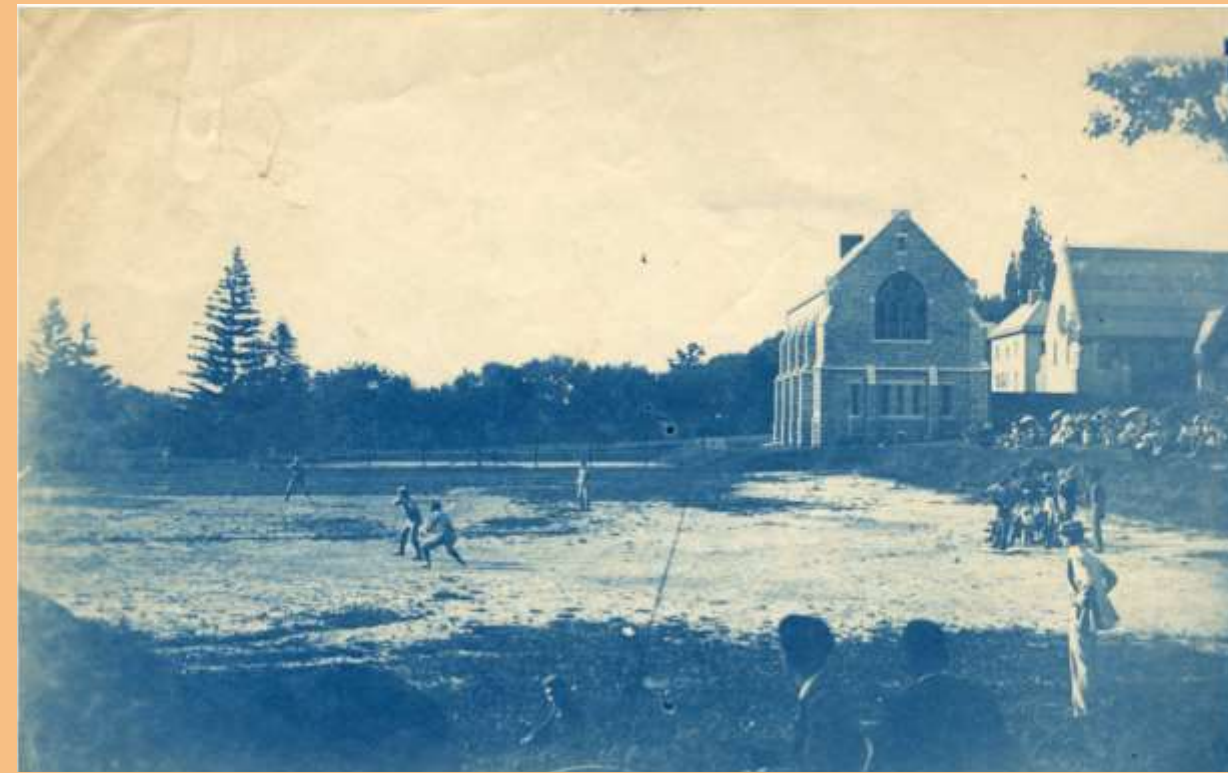
Hobart's earliest athletic field was a baseball diamond behind the college chapel.

These colleges represent the arc of sports in America, from calisthenics to intercollegiate teams. Hobart has dominated in lacrosse. William Smith sports have gone from social play to winning national championships. Finger Lakes Community College (FLCC) is the only two-year college with a logging sports team. Together, they form a rich sports history in Geneva.