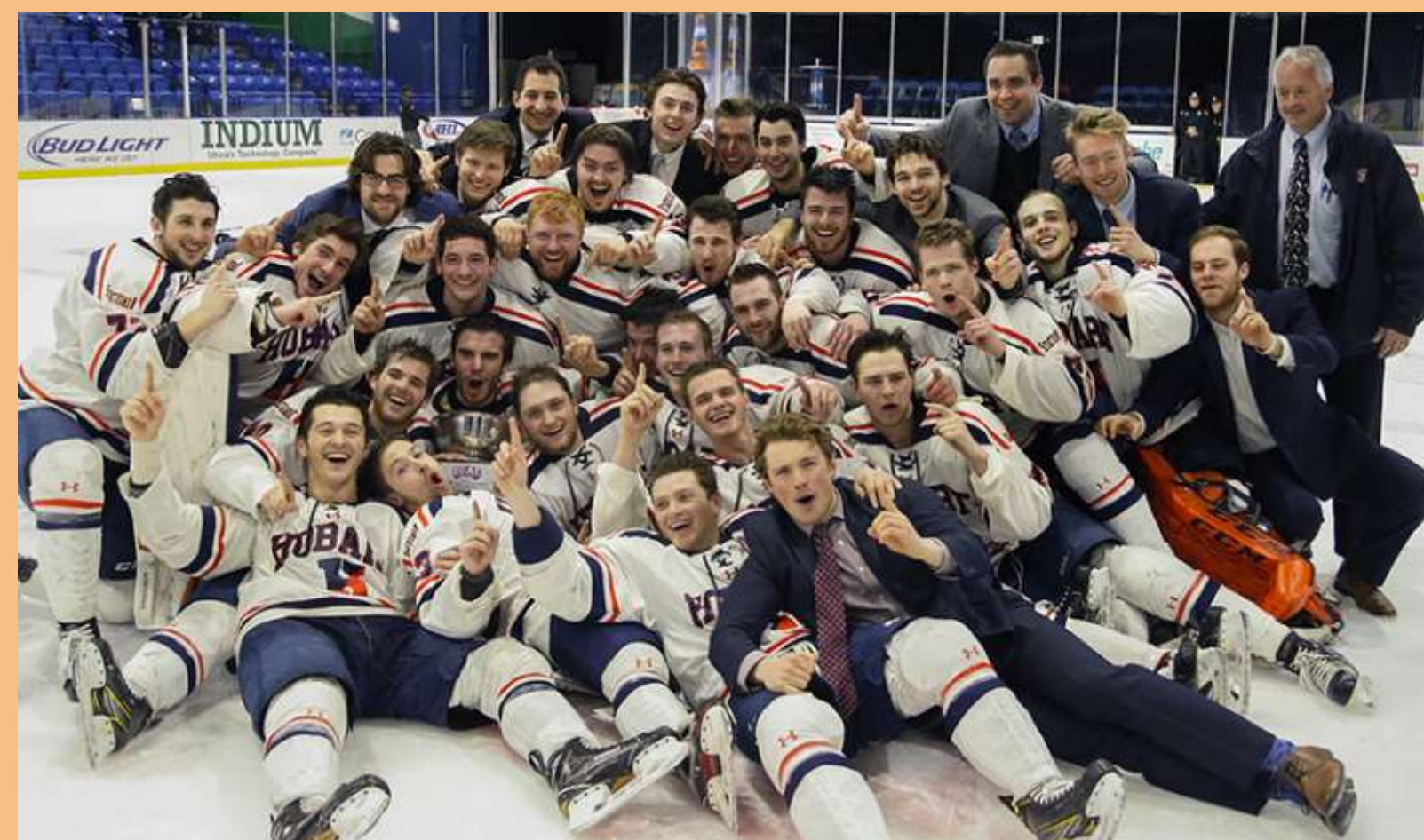
Initially a club sport, hockey became intercollegiate in 1978 when the city of Geneva built a permanent rink. In 2006 and 2009, the team reached the national championship "Frozen Four" round.