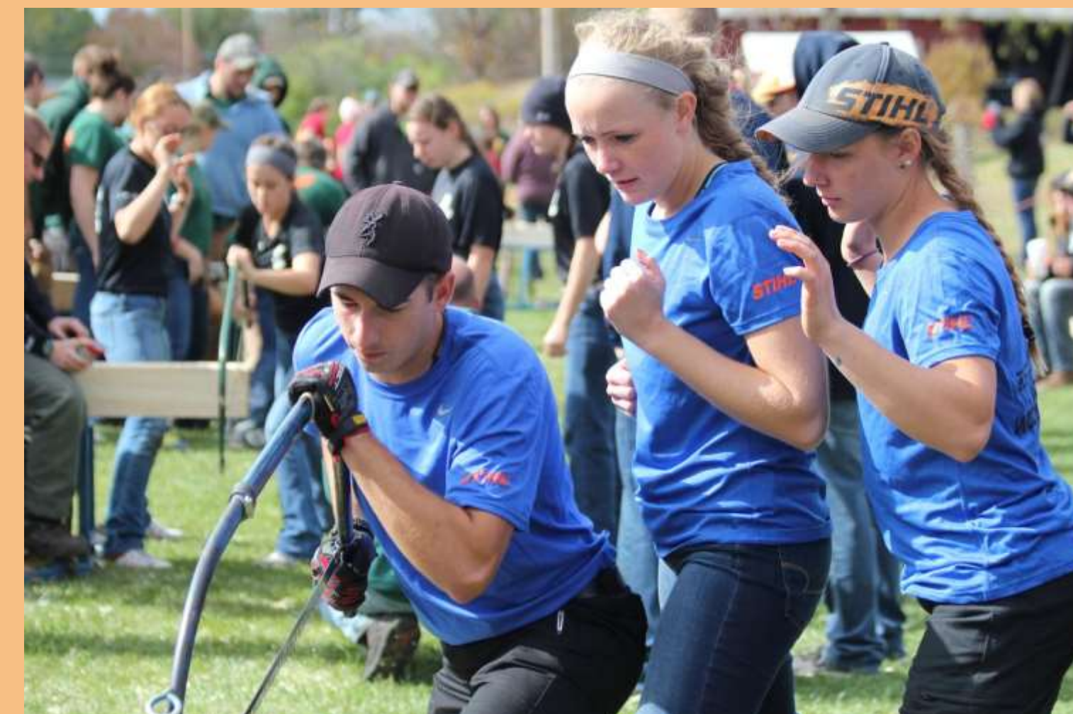
An outgrowth of FLCC's conservation program, logging sports began as a club and is now part of the athletic department.