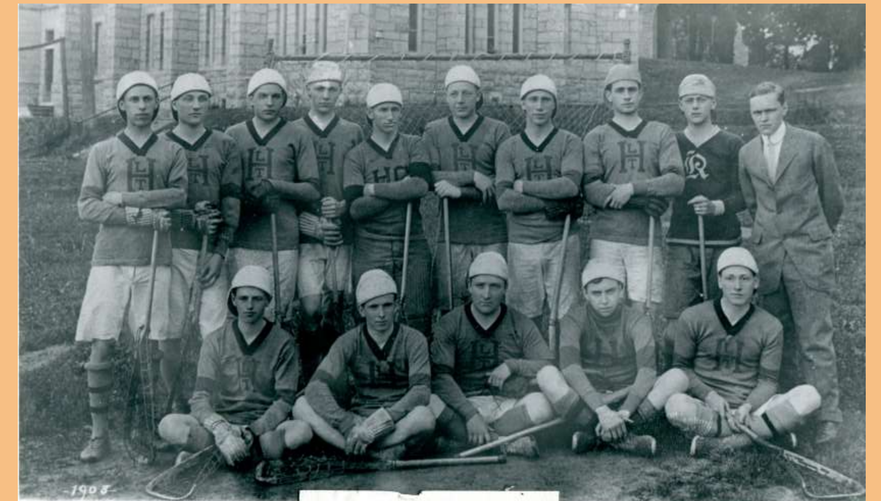
In 1898 the lacrosse team won their first game, beating Cornell University 2-1. Photo taken in 1908.