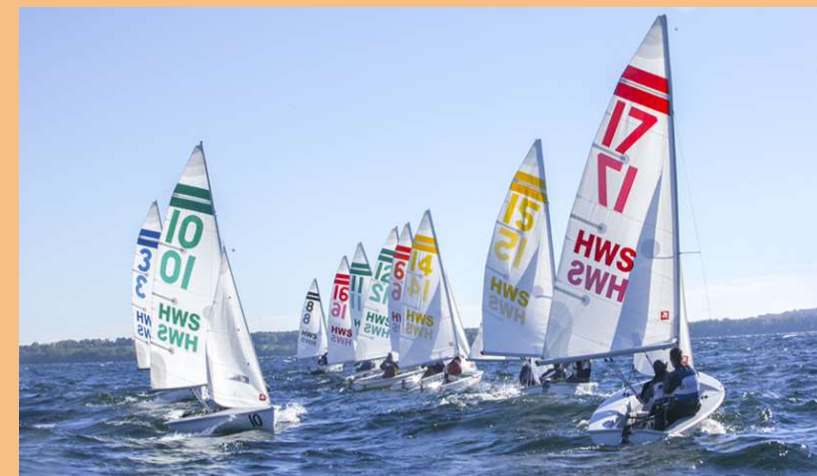
In 1997, sailing became a varsity sport and the team finished the fall and spring seasons ranked number one in the nation.