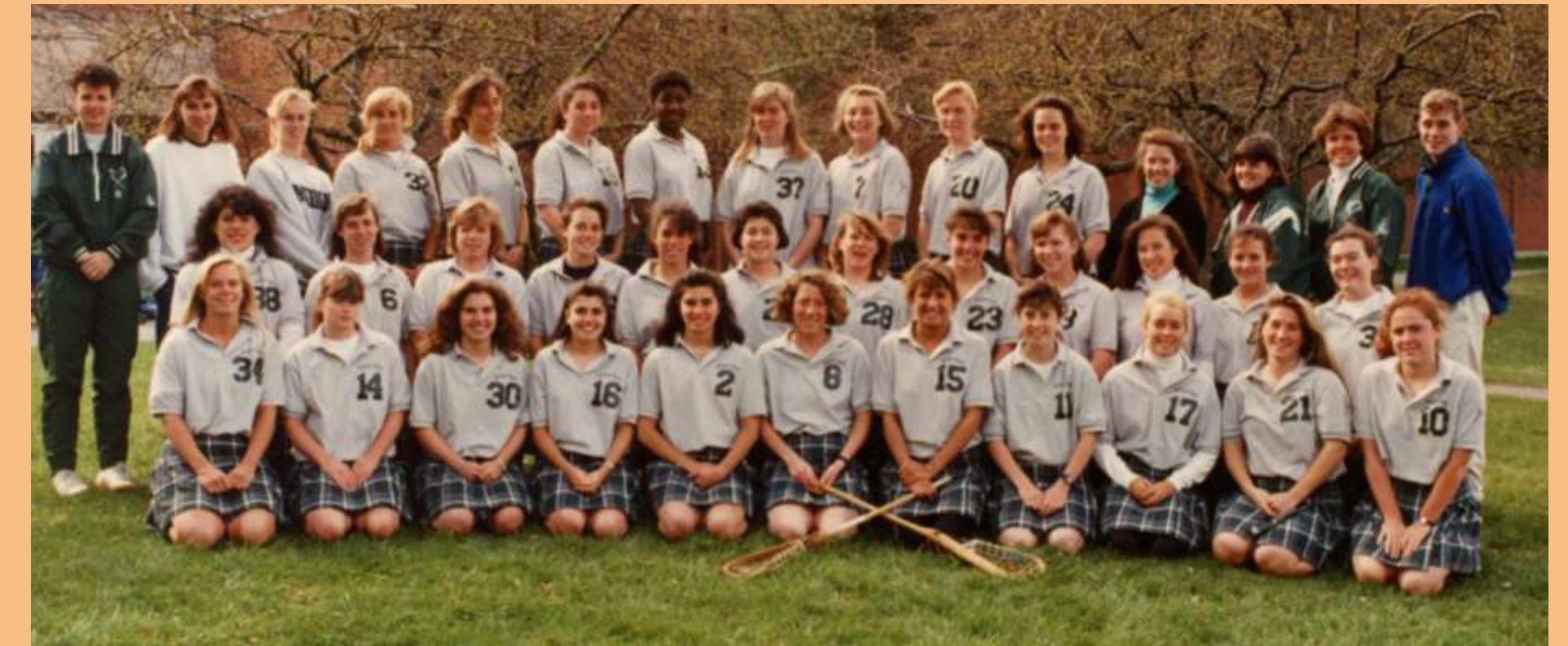
Lacrosse is a signature sport for all three colleges. Undated photo of William Smith team.