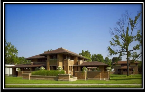
The Martin House, Buffalo