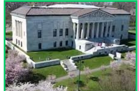
Buffalo History Museum