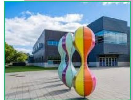
Burchfield Penney Art Center

Please arrive 10 minutes ahead of time listed at your pick-up - the bus cannot wait for late arrivals.