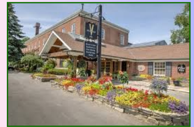
Pillar & Post

See reverse for Terms & Conditions and the recommended Cancellation Protection Plan (CPP)